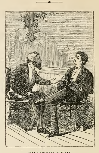
CHAPTER LXIII. ATLEE ON HIS TRAVELS.

most dignified sincerity he bowed him out, and Atlee hastened away to tell his chief that he had "squared the Turk," and would sail on the mor-